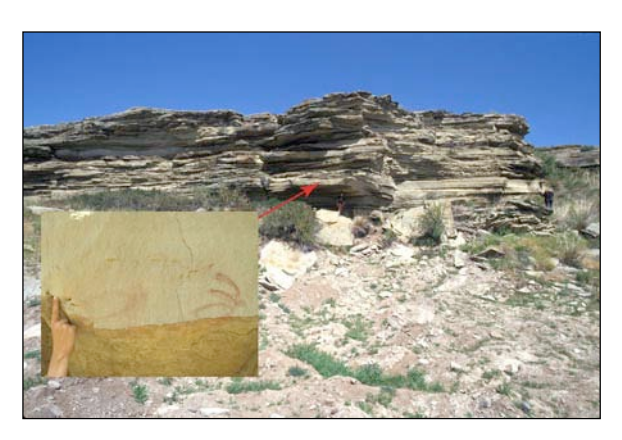
photo), an unidentifiable four-legged animal (on the left of the inset), and possibly remnants of other figures now deteriorated into red stains. On a traversable ledge above the shelter is a red bear paw with a solid pad and four toes. The paw is vertical as if walking up the cliff.

Under the main jump area is a small rockshelter with pictographs on both the wall and the ledge above the shelter. There is a possible bird track (on the right on the inset